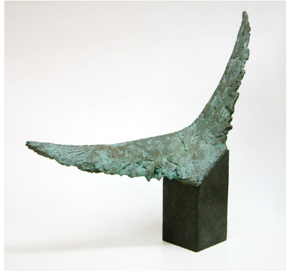
1987 ALTEA TROPHY Annual Award Altea Hotels. Bronze, 45cm.