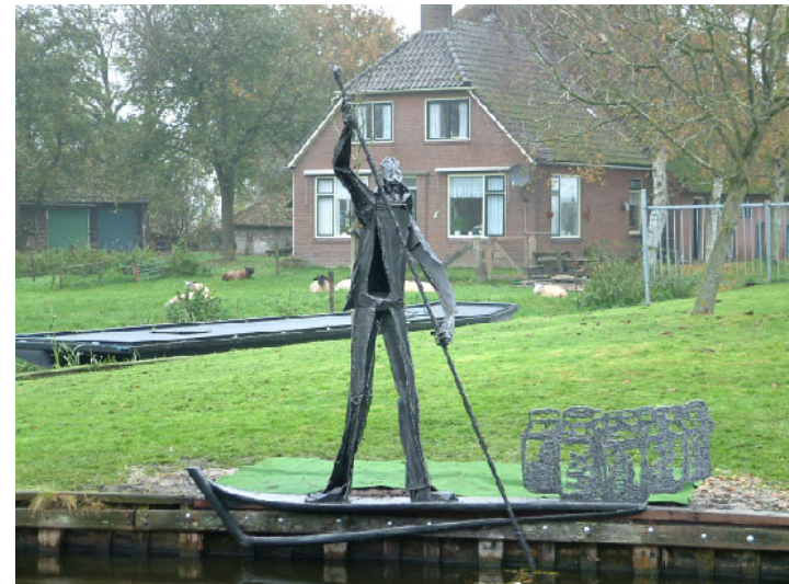
2004 MILKBOATMAN Belt-Schutsloot, Holland Coated steel, length 3,5, high 2,75 mtr.