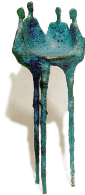
1991 HOSPITALITY Bronz, 35cm