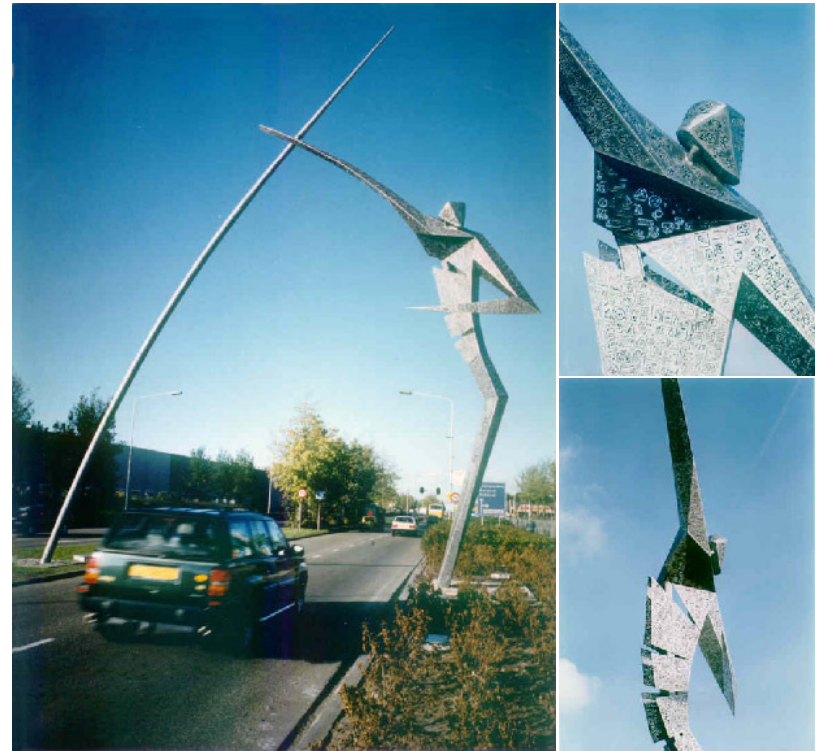
1995 POLE VAULTER Philips plant, Drachten, Holland. Steel, 15 mx 10 m., 1176 cutout marks.