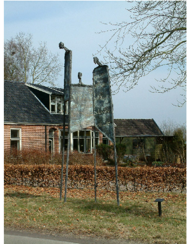
2002 FARMERS, CITIZENS, FOREIGNERS Borgercompagnie, Holland Steel, 4,75 m. high