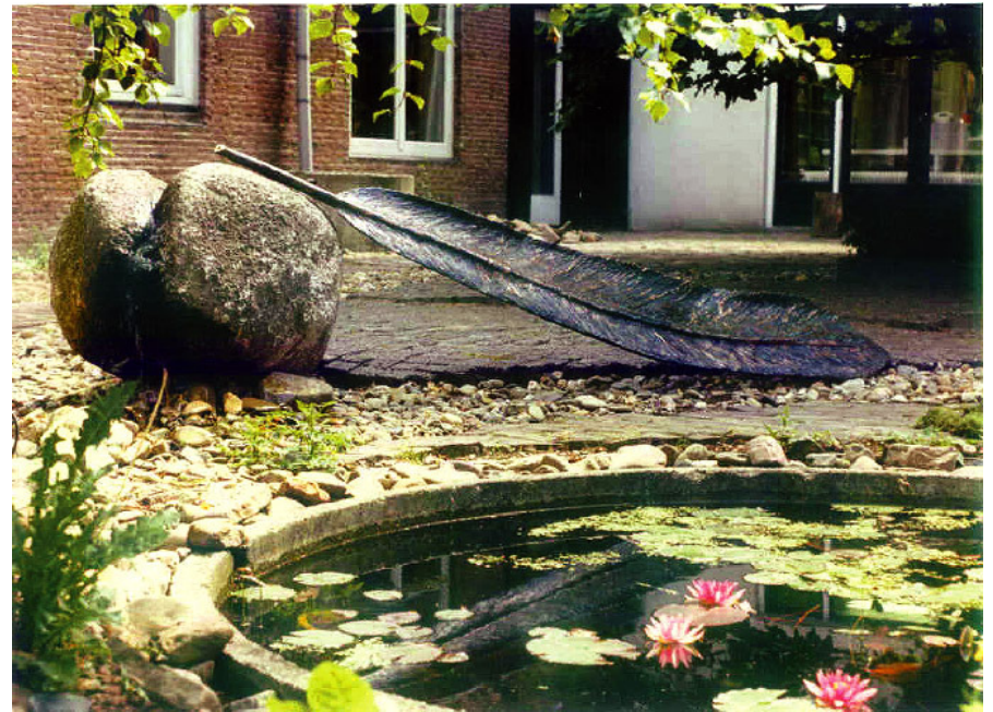
1981 FEATHER Cultural Centre, Groningen Holland. Bronze, 2.50m.