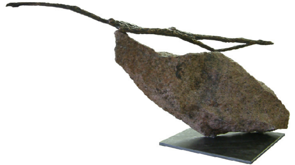
2006 SWIMMER Sculptor's collection bionzs, geanite, length 70cm.