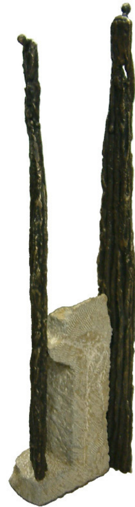
2006 CLOSE DISTANCE Sculptor's collection bronze French marble, 1mtr.