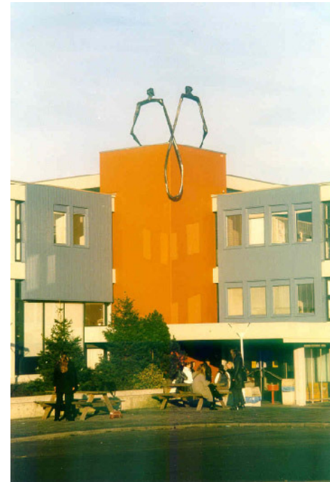
2001 GAMMA Hanzehogeschool Groningen, Holland. Steel, 4,5mtr.