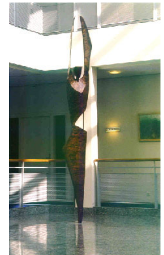
1998 FREIA Sculpture & 20 miniatures Freia Co., Gron., Holland. Copper 3,60m.h igh + 40cm b ronzes.