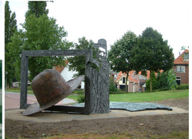
2004 SOUTHERN SEASIGHT City of Harderwijk, Holland Green marble, bronze, steel, 3.5x5x7 mtr.