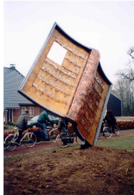
2002 STORY FROM AFAR Borgercompagnie, Holland Steel, 3 mtr. High