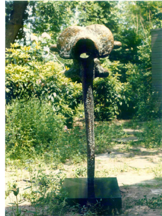
1981 VERTEBRA Prison Groningen, Holland. Bronze on black granite, 1.20 m.