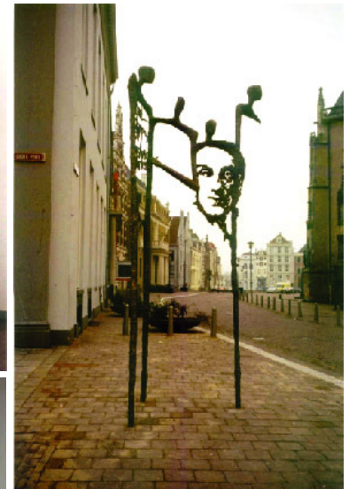
1996 JOHANNES VAN VLOTEN Humanists memorial, Deventer, Holland. Bronze, 3.90 m., width 2 m.