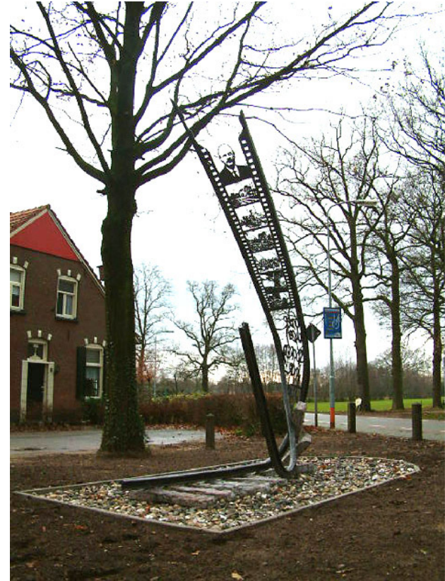
2002 TRACK TEACH TIMES Dinxperlo, Holland Coated steel and granite 4,5 mtr. High