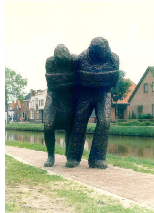
1986 SHIPTOWING PEOPLE Oude Pekela, Holland Bronze, 1,80 x 2 x 1 m