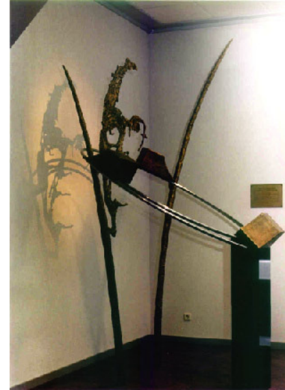
1989 HOROWITZ Philips DAP plant at Drachten, Holland. Bronze, stainl. steel, granite, 3.20m.