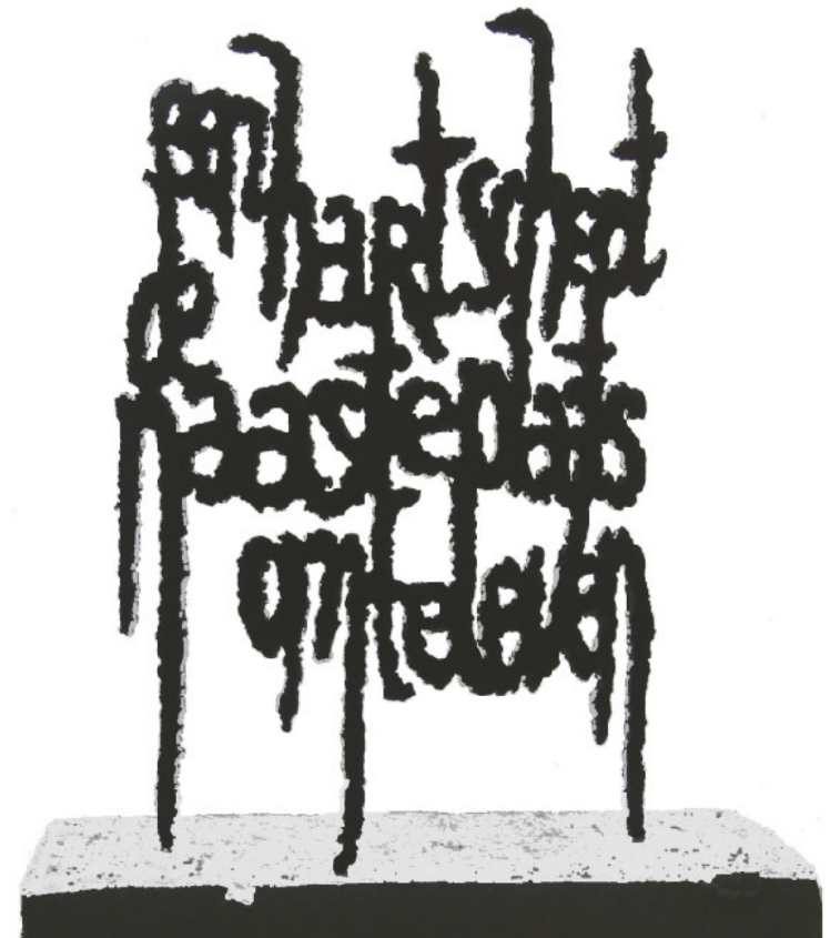
2005 A heart creates the neighbour's place to live