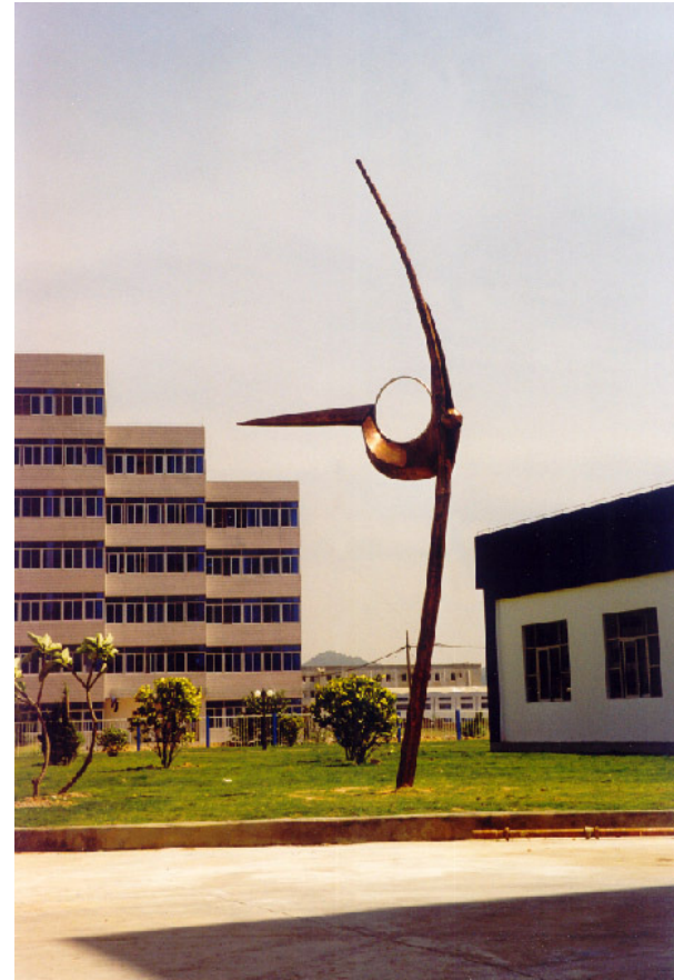
1998 THE LEAP Philips DAP, Zhuhai, Guangzhou China. Copper, stainless steel 6,12m. High