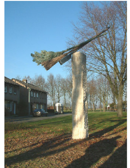
1992 CROSSING BORDERS Siebengewald, Gem. Bergen(L), Holland Stone, steel, bronze, 3,50m. High