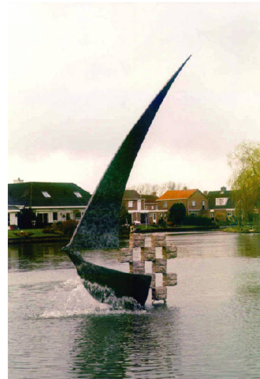
2000 PEAT-SHIPPING Cingelkolk, Zwartsluis, Holland. Steel, granite and fountains, 5m.