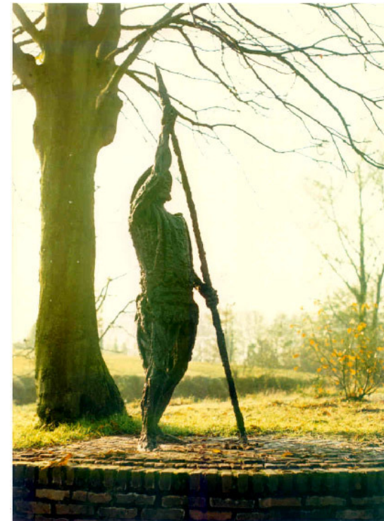
1985 SENTINEL Fortress of Bourtange, Holland. Bronze, 2.20m.