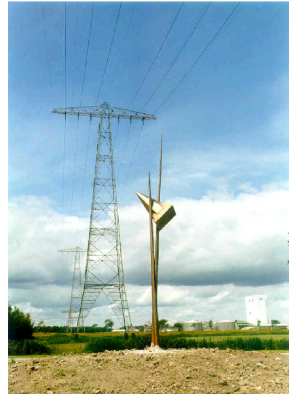
1998 LOST TOWERS Weiwerd cemetery and Heveskes, Delfzijl, Holland. Copper. Height 2.30 and 2.40 m.