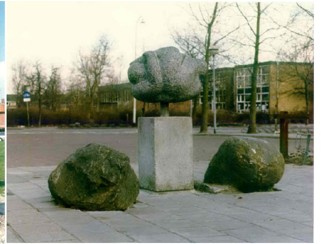
1979 WRESTLERS Sporting Centre Groningen, Holland Freestone, 1.50 m.