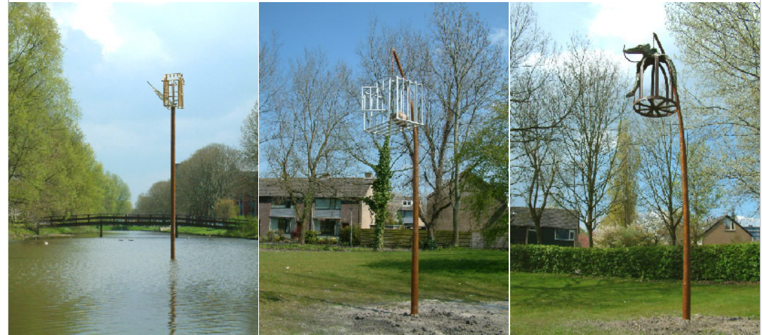
2003 OUTLAWED Kornalijn-park, Groningen, Holland 3 x Coated steel and bronze, 6 mtr.

OUTLAWED Three different opened cages rising up to 7 metres high at the Kornalijnpark in Groningen symbolise their meaning as the first monument for all excluded people in the world. This group of sculptures has been revealed on 04-16-2004.