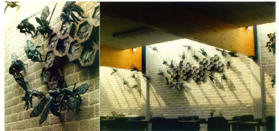
1983 BEEES Social Work Dept., Groningen, Holland. 3 Honeycombs with 58 bees, bronze.