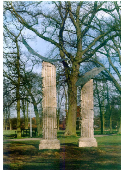
1992 FEDERA Park The Braak, Eelde, Holland. Stone, bronze, 3.80 & 5.60m high.