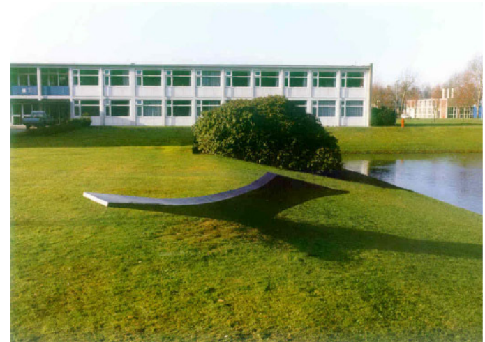
1992 FLYING START KLM Flightacademy, Eelde Airport, Holland. Copper, length 5.60m.