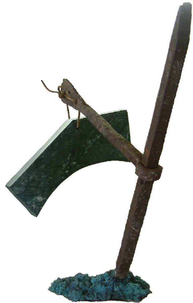
2006 SOUND FRIENDSHIP Randag Collection, Bronze, Steel, Soundstone 50cm high