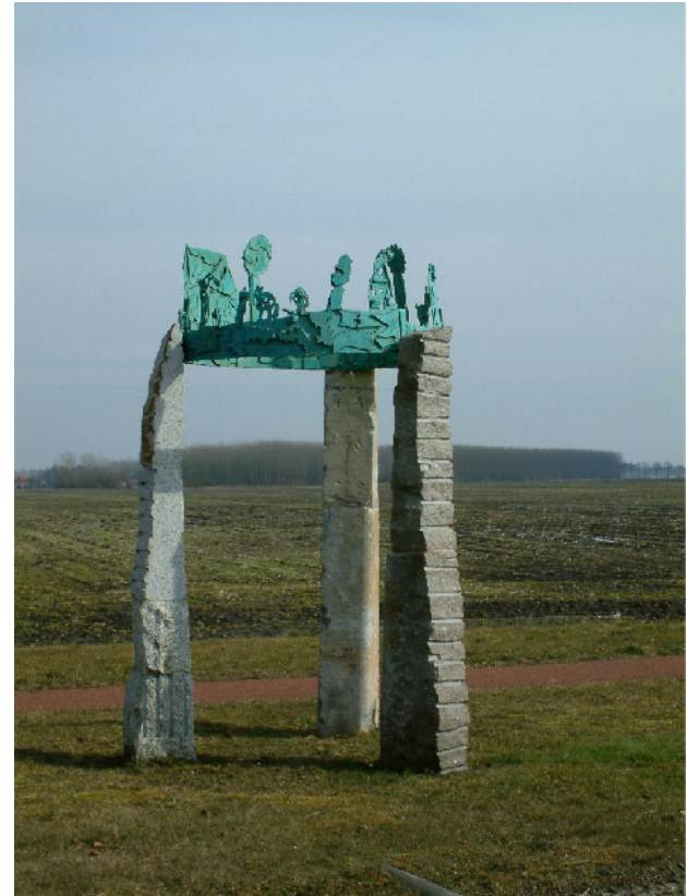
2002 ENTRANCES Borgercompagnie, Holland Stone, steel, 3,50 m. high