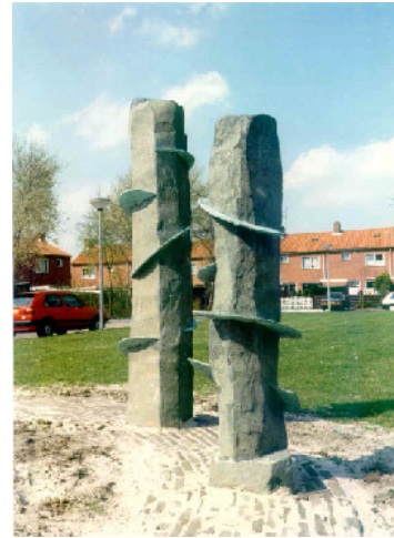
1990 CLAYPRESS Oostwold, Scheemda, Holland. 2 Basalt, bronze forms, 2.60m.;2.20m.