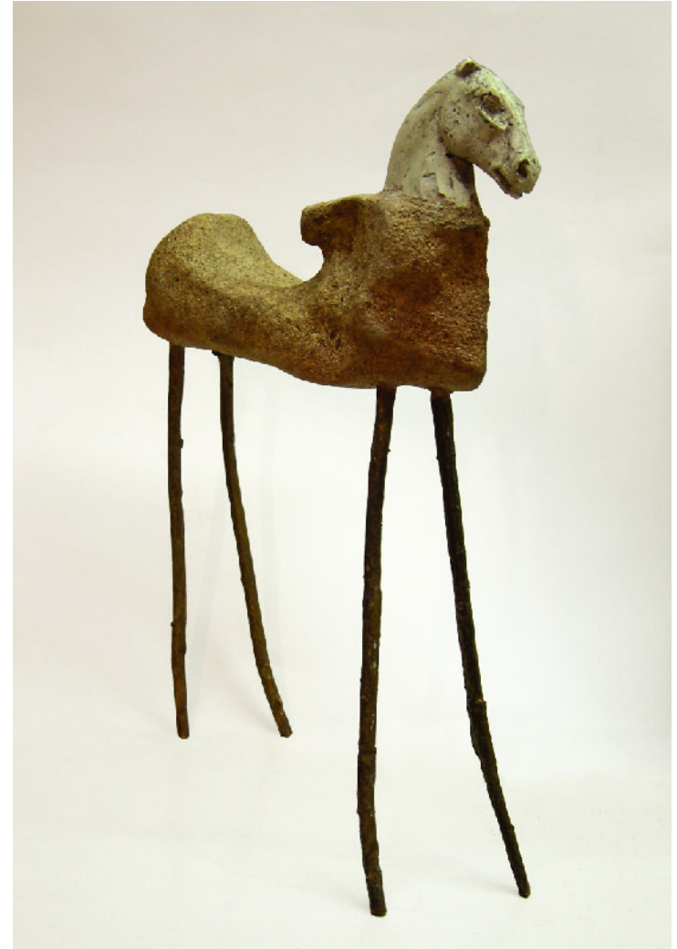
2001 PAS DE DEUX Kiestra collection Stone, bronze, gypsum 35cm